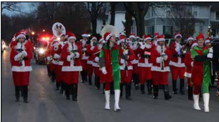
The Santa Band made an appearance at the annual Light Up Akron parade. They also played and toured at the following places: NFTA Bus Station, Feedmore, Airport, Amberleigh, Dave Smith Ford, Eastern Hills Mall, Mark Recordings and Adesa.