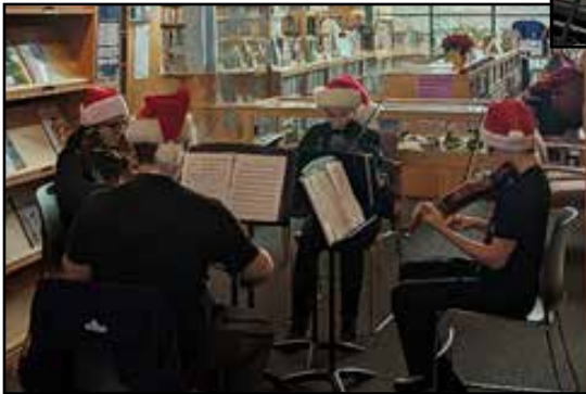
The Orchestra toured Harris Hill Nursing Facility, Vinecroft Retirement Community, and the Newstead Senior Center where they performed a number of Christmas pieces for the residents.