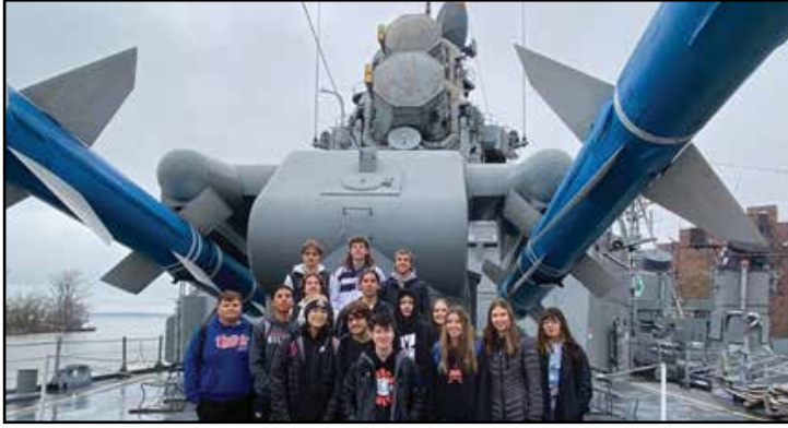
Students attended a Field Trip the Buffalo Naval Park on December 7th, for their Pearl Harbor ceremony. There was an FDR reenactor during the program and students had the opportunity to tour the naval ships.