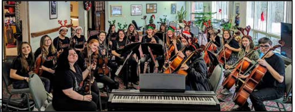
During the Light Up Akron events around town, two string quartets performed at the Newstead Library.